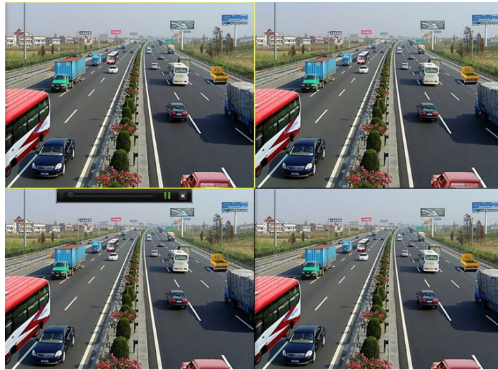
Instant Playback Interface

Note: Only files recorded during the past five minutes on this channel will be played back.